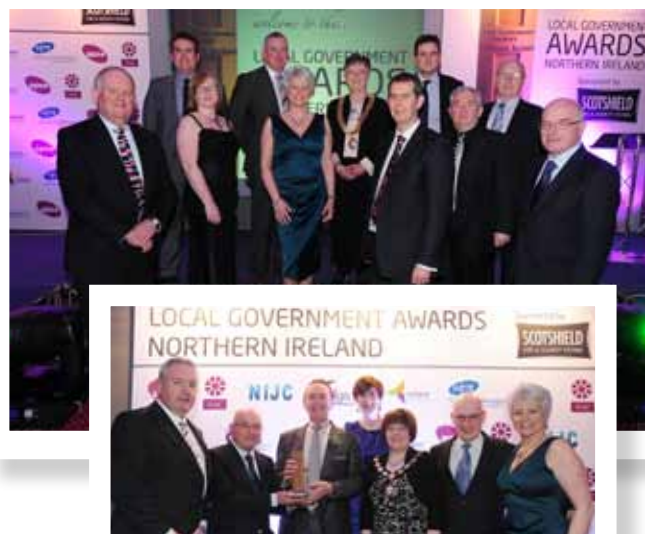
Visual snapshots from the Local Government Awards Northern Ireland 2010

The NILGA Conference gala dinner played host to the Local Government Awards Northern Ireland on 10th February 2011. The awards were attended by over 250 people with seven award winners collecting their deserved prizes. Award partners included: Association for Public Service Excellence; National Association of Councillors; SOLACE NI; William Johnston Memorial Trust; NIJC and of course NILGA. The awards event was sponsored by Scotshield with the partners thanking the sponsor for their ongoing commitment and support.