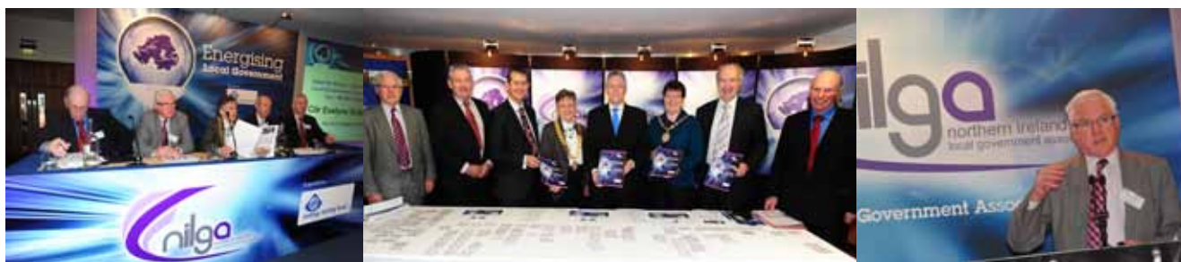
Visual snapshots from Conference 2011

future services. Topics of discussion considered the spending review, the economy and an overview of what the Association has achieved in 2010 and is tasked to take forward over the coming year.