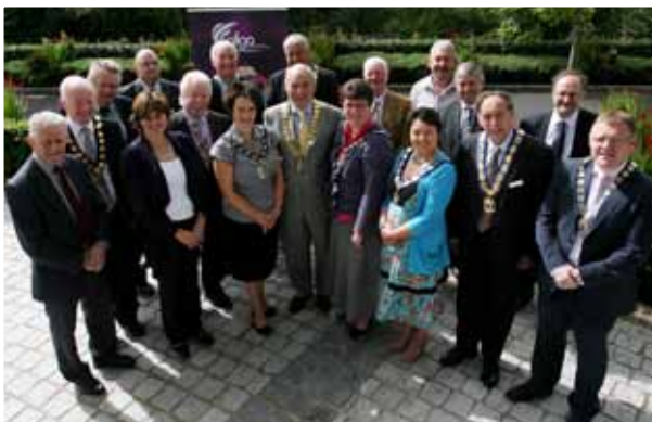
Mayors and Chairs from councils across Northern Ireland attend NILGA's 2010 Mayors and Chairs meeting which was held in Antrim Civic Centre (Aug. 2010).

During the year, five Full Members' meetings were held, for the 147 elected councillors who represent their councils on the Association and the 25 Chief Executives. These meetings focussed on key policy issues, to enable strategic local government debate on issues such as: urban regeneration, tourism, the ICE programme, the future role of NILGA, the 2011-14 NI Budget and Comprehensive Spending Review, planning policy and welfare of animals. A Mayors and Chairs event was also held in August 2010, to assist in developing relationships within the sector.